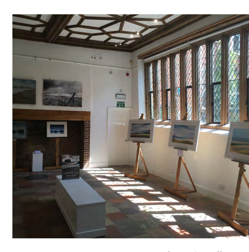
The Main Gallery The Courtyard