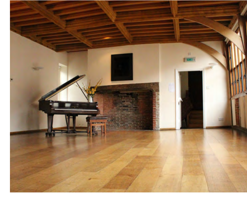
The Music Room

NEW from Autumn 2021, we can now host your ceremony in our beautiful, tranquil outdoor courtyard where you will be surrounded by the architecture of our historic Tudor building. The capacity for this area is 60 people. We can offer wet weather alternatives when booking the Courtyard, which would be the Music Room or Main Gallery.